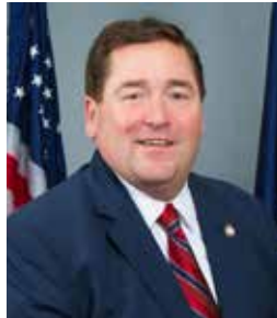
BILLY NUNGESSER Lieutenant Governor