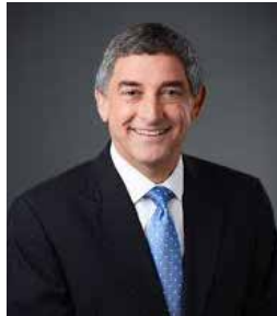
JAY DARDENNE Commissioner of Administration