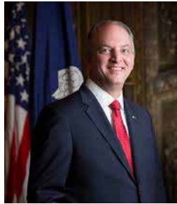
JOHN BEL EDWARDS Governor